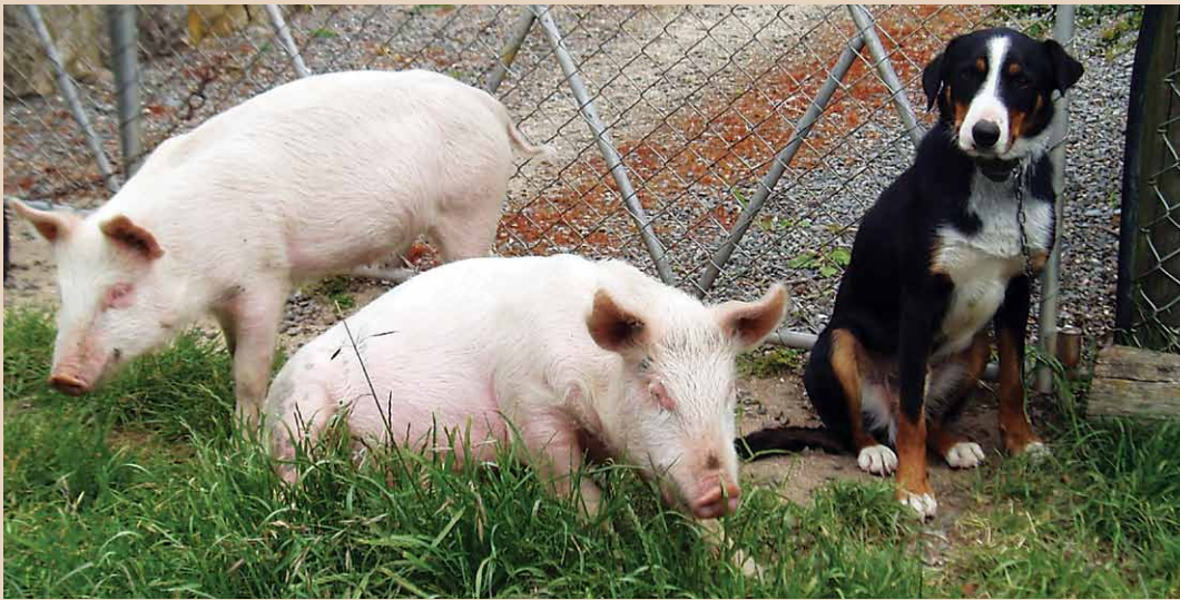
This is not a real pig dog.

A bandage that can be used as a tourniquet is an essential part of kit for anyone in the bush....one saved a possum hunting friend of mine years ago having suffered a deep gash.....so it's not just our canine mates that bandages can do wonders for.